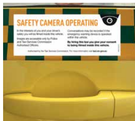
Example shown is front passenger door.

The label also notifies passengers that their conversations may be recorded if the emergency warning device is operated.