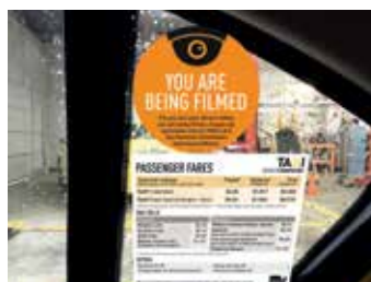
Example shown is rear quarter window.

If you require further information about label placement in other makes/models of vehicles (including van type taxis), please call 1800 638 802 .