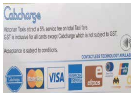
Example of internal payment surcharge label.