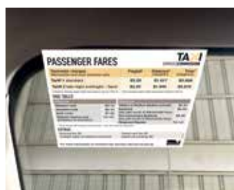
Example shown is upper left front windscreen.