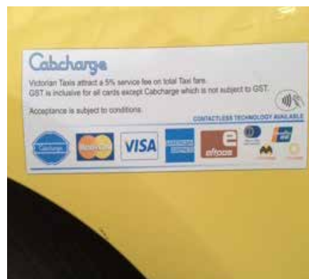
Example is shown on the front quarter panel